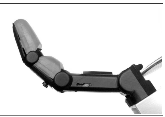
Figure 3. Shadow Finger Test Unit.

The Shadow Finger Test Unit is derived from the Shadow Dextrous Hand and allows research into the operation of compliant manipulators. The Shadow Finger Test Unit is driven by Shadow Air Muscles and allows all sensing capabilities used in the Hand system to be experimented with on a smaller scale.