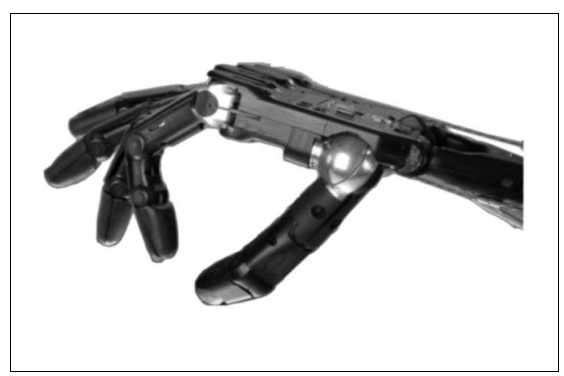
Figure 2. Shadow Dextrous Hand.

The Shadow Dextrous Hand is the first humanoid robot hand unit commercially available offering 25 degrees of freedom and optional tactile sensing embedded in all fingertips. It offers specific advantages in that it has been designed as a modular solution to robotic manipulation requirements.